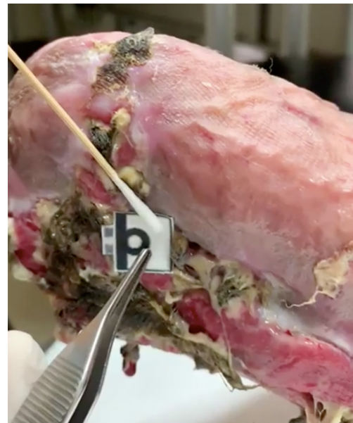
Figure 3 Demonstration of our paper-based detection device on an operating table.

The sensitivity of our paper-based detection device was previously tested using both buffer and tear systems, and the limit of detection (LOD) for both systems was approximately 0.0186 and 0.76 µg/mL, respectively (15). To evaluate the real-world applicability of our paper-based detection device, we tested it by directly applying it to patient wounds. Figure 2 shows that our device provided a visible colorimetric response (from colorless to light yellow) after absorbing wound fluid from patient 4 ( Figure 3 ), indicating that our device can be successfully applied in a clinical setting without requiring any expensive analytical equipment or complex operating methods. In order to quantify the HNE level from each patient, we converted the recorded colorimetric response to blue using ImageJ software and defined our mean intensity as (test zone intensity) – (blank zone intensity). A total of 8 patients were examined, and the HNE mean values were calculated as presented in Table 1 . According to the results we conducted and other previously published research, a higher level of HNE can be found in delayed healing wounds (13-15). In this study, high levels of HNE were recorded from all 8 chronic wound patients, suggesting a retarded wound