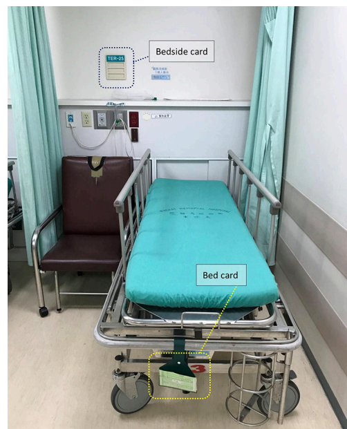
Figure 1 Traditional bedside card (blue dot) and bed card (yellow dot) in the emergency department.

The workload of the emergency staff is very heavy, and the patients' locations change frequently. After ER physicians visit the patients, some must remain in bed, awaiting laboratory results and anticipating treatments. After the ER physicians' re-evaluation, some patients are discharged with medicine, while others are admitted to the hospital or transferred to other hospitals. Therefore, the information on bedside card must change frequently to correctly reflect the patients' information and status. If the actual information on the bedside card is not updated quickly with the change of each patient, the medical staff may provide the incorrect treatment to the incorrect patient, thereby increasing the risk of medical litigation. Furthermore, the beds in the ER are limited and need to be fully utilized. Therefore, a real-time bedside card recording