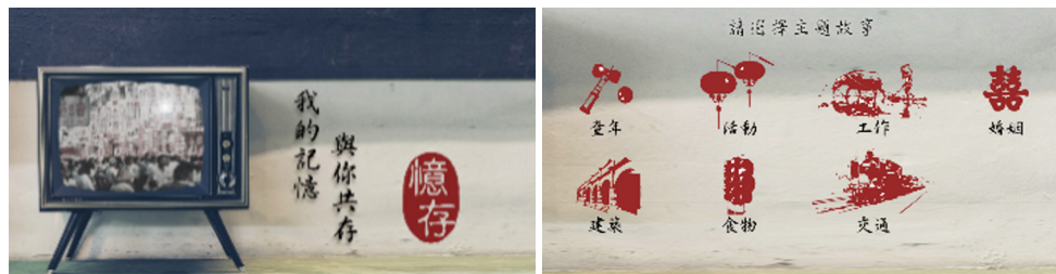
Figure 1 Interface design of the application system.

reminiscence system featuring Taiwan's representative reminiscence elements, in order to facilitate caregivers accompanying patients with dementia for reminiscence therapy, and (II) to explore the usability of this application system for patients with mild or moderate dementia.